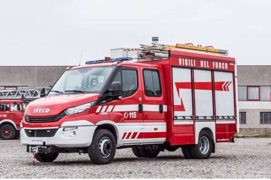
Italy, Vigili del Fuoco, Verola Nuova – Brescia. FIREMIKS 450-0,3-0,6-1-PP-F-ALU installed in an IVECO truck made by Fortini Anticendi. Flow range 100-450 lpm and selectable dosing rate 0,3-0,6-1%, max pressure 16 bar.