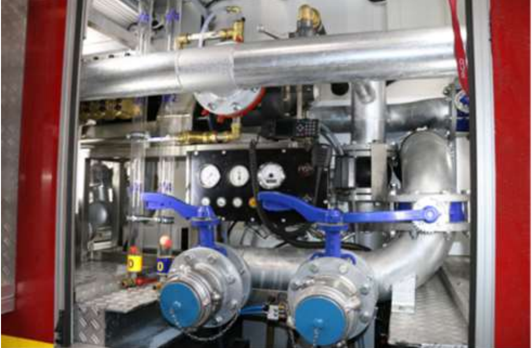
Lithuania, Fire truck built by Iskada for PKN Orlean's refinery in Mazeikiu, Renault C 430 6x4 double cab. 4000 liters of water, 2000 liters of foam concentrate. Water pump: JOHSTADT NP6000S 6000 l/min at 10 bars. FIREMIKS 4800-3-PP-F-ALU with flowrate up to 4800 l/min, 3% dosing rate.