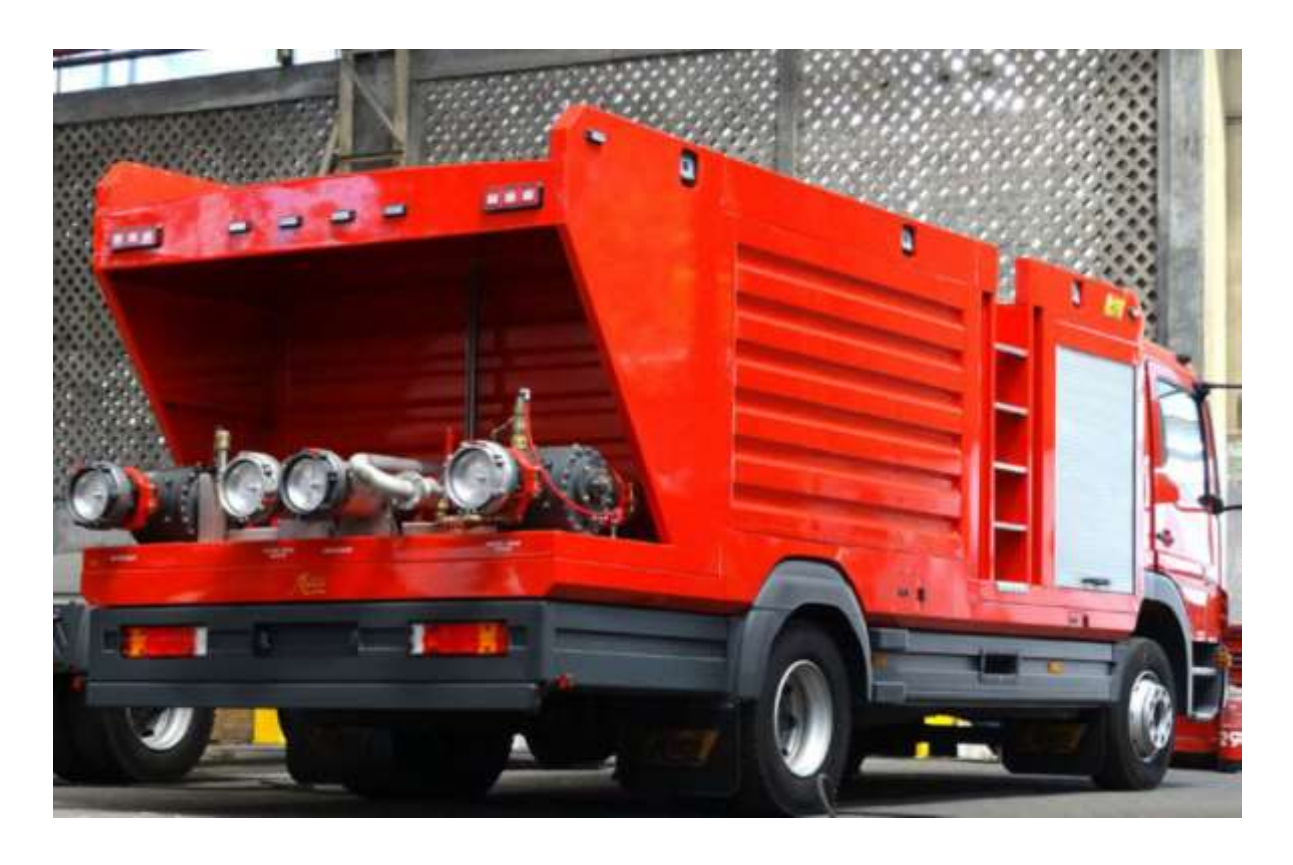
Indonesia, two Foam trucks built by PT Meco Inoxprima for Pertamina, State oil company, each truck equipped with 2 x FIREMIKS 8000-3-GP-F-ALU, giving total 16,000 lpm capacity of dosing 3% concentrate.