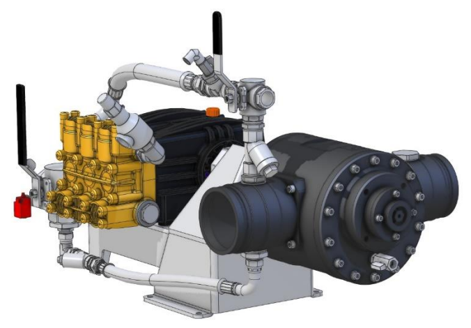
Note: For illustration only. Refer to Dimensional Drawing for accurate representation of each model.

3% dosing system for firefighting - for fixed installations connected to a concentrate tank with gravity feed to dosing pump. Consists mainly of two volumetric parts; a Water motor and a Piston pump. Equipped with a Manual air relief valve. Flushing of dosing pump is done automatically when the concentrate inlet is closed with 3-way ball valve, (no 4 on Flow chart). Water motor available in three different materials, aluminium, nickel-aluminium bronze and stainless steel 316L.