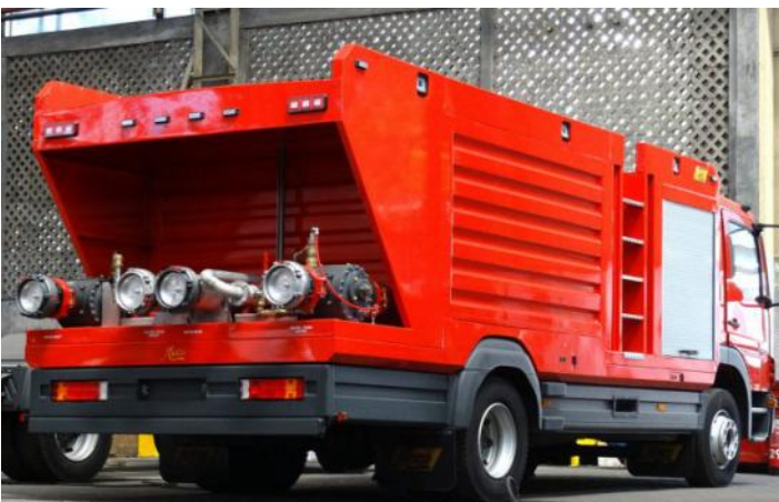
Fire truck mounted option

With Firemiks units, water is the only power source required. Firemiks provides fire ground flexibility in every sense because it can be fire truck, trailer, or trolley mounted as well as part of a fixed system. With all versions, a unit can be mounted far enough away from the fire ground so that both fire personnel & site water supplies are not jeopardised by the fire itself.