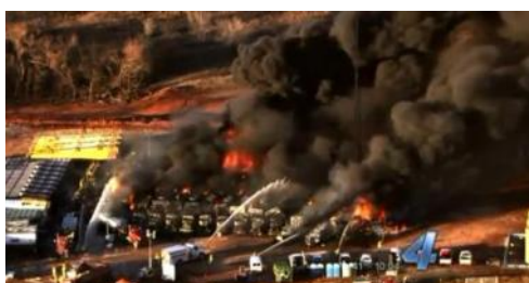
Images from the first quarter of Shared Learning 2016